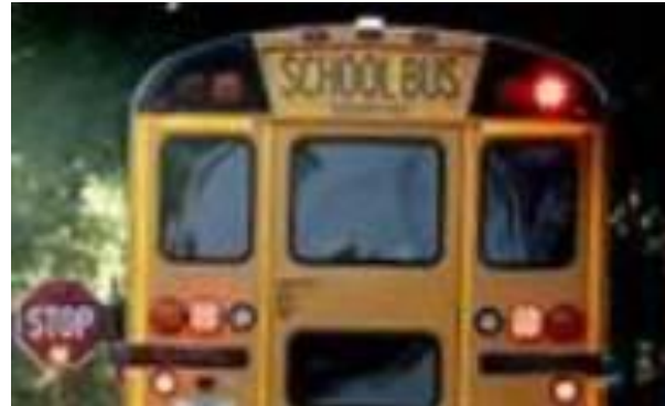
Top Row Outside - REDS

All Grass Lake buses are equipped with an “8-Light” overhead stop light system, which means there are two amber lights in front and in back, and two red lights in front and in back , in addition to a single “STOP” sign near the driver’s compartment.