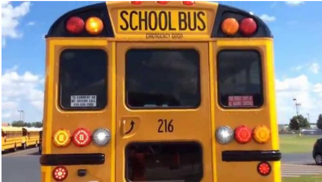
Top Row Inside - AMBERS