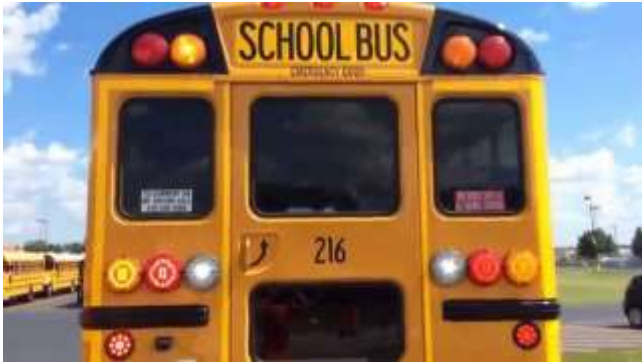
Top Row Inside - AMBERS