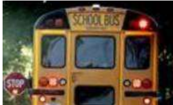
Top Row Outside - REDS

All Grass Lake buses are equipped with an "8-Light" overhead stop light system, which means there are two amber lights in front and in back, and two red lights in front and in back , in addition to a single "STOP" sign near the driver's compartment.