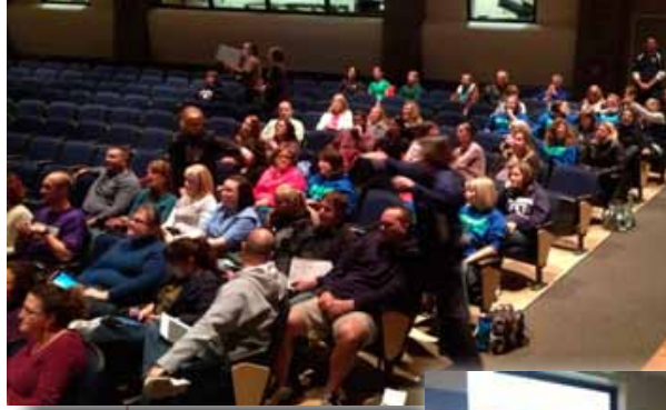
Above: Teachers attending Tech Slam