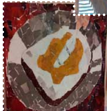
Keith Haring Graffiti Person by 6th Grader