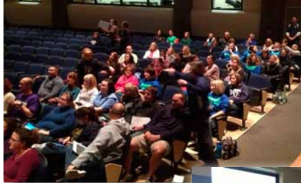
Above: Teachers attending Tech Slam