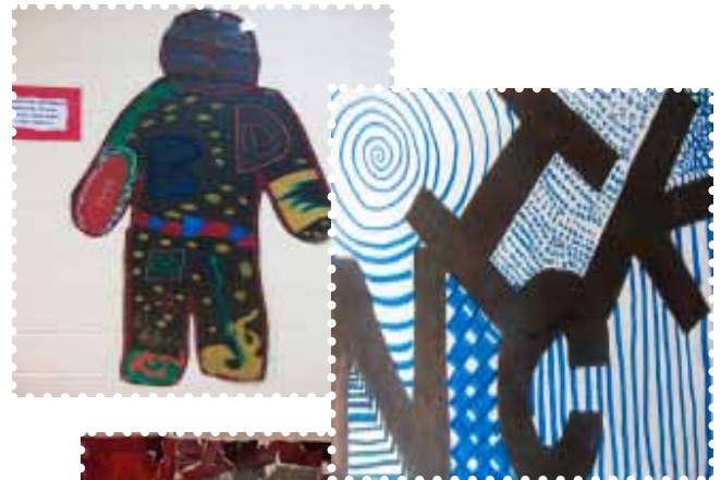
Keith Haring Graffiti Person by 6th Grader

Keep checking back for updates to see how our students are continually progressing in their art education!